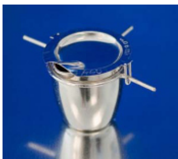
Fig.2: Cup for electrical fusion machine with removable cover.